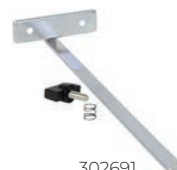
302691 Guide Optional Accessory COMING SOON