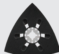
782791 93 x 93mm Velcro Sanding Pad