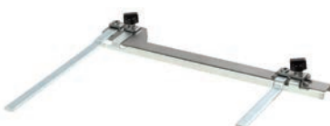
380742 Guide Rail Adaptor Optional Accessory COMING SOON